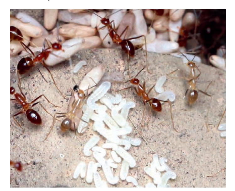
Yellow crazy ants pupa