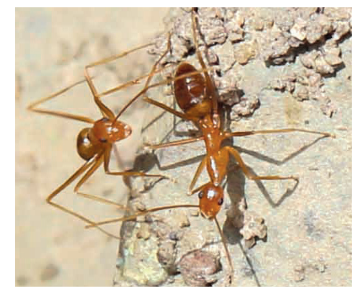
Yellow crazy ants