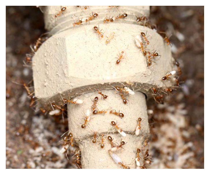
Yellow crazy ants smothering pipe