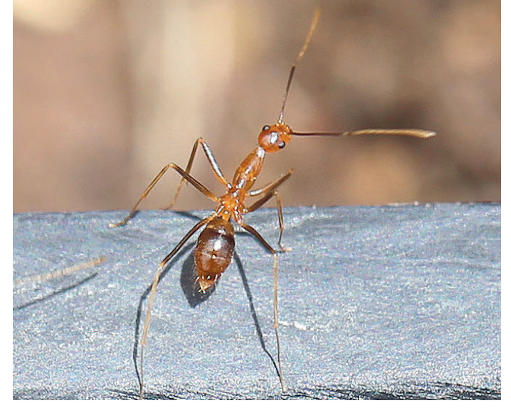
Yellow crazy ant