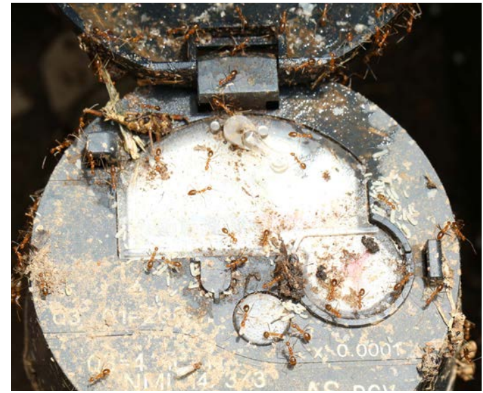
Yellow crazy ants can be found on meters