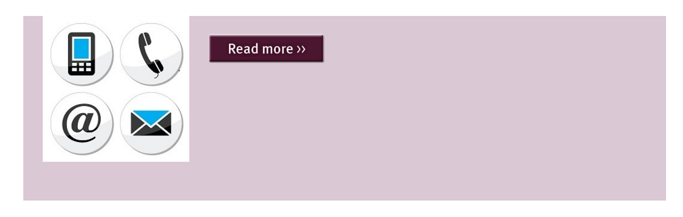
Registry of Births, Deaths and Marriages Queensland (RBDM) | www.qld.gov.au/rbdm