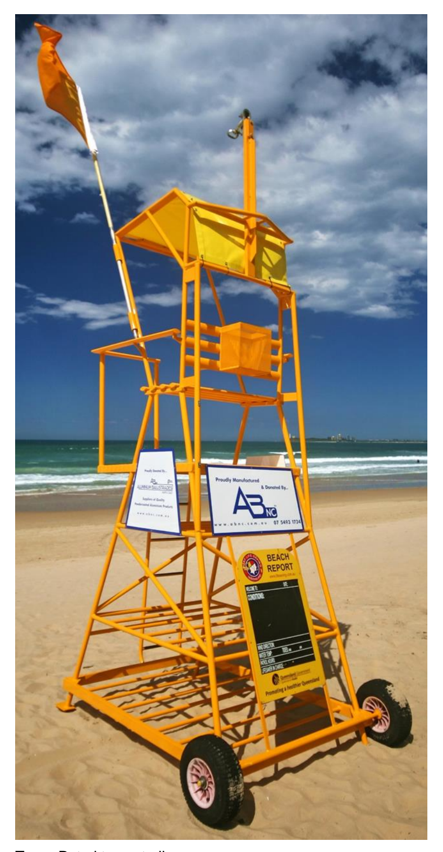
Purpose : To store and transport specialised equipment required by Surf Life Saving Queensland.