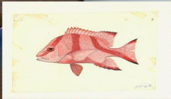
DR5973, Red Emperor (juvenile)