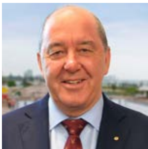
The Honourable Robert Borbidge AO (Chair) Former Premier of Queensland

The Embracing 2018 Advisory Committee members include: