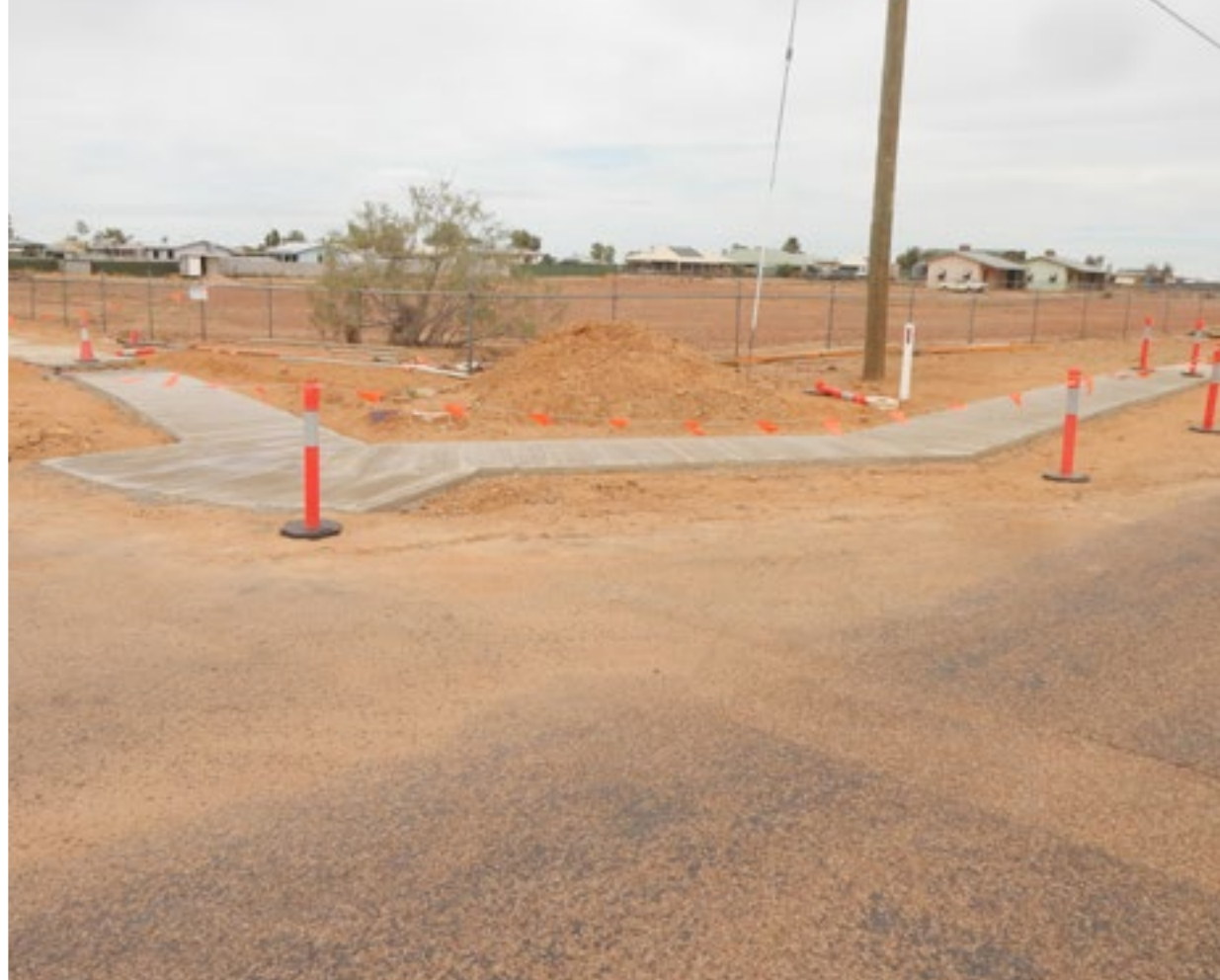
Birdsville footpath, Diamantina Shire Council