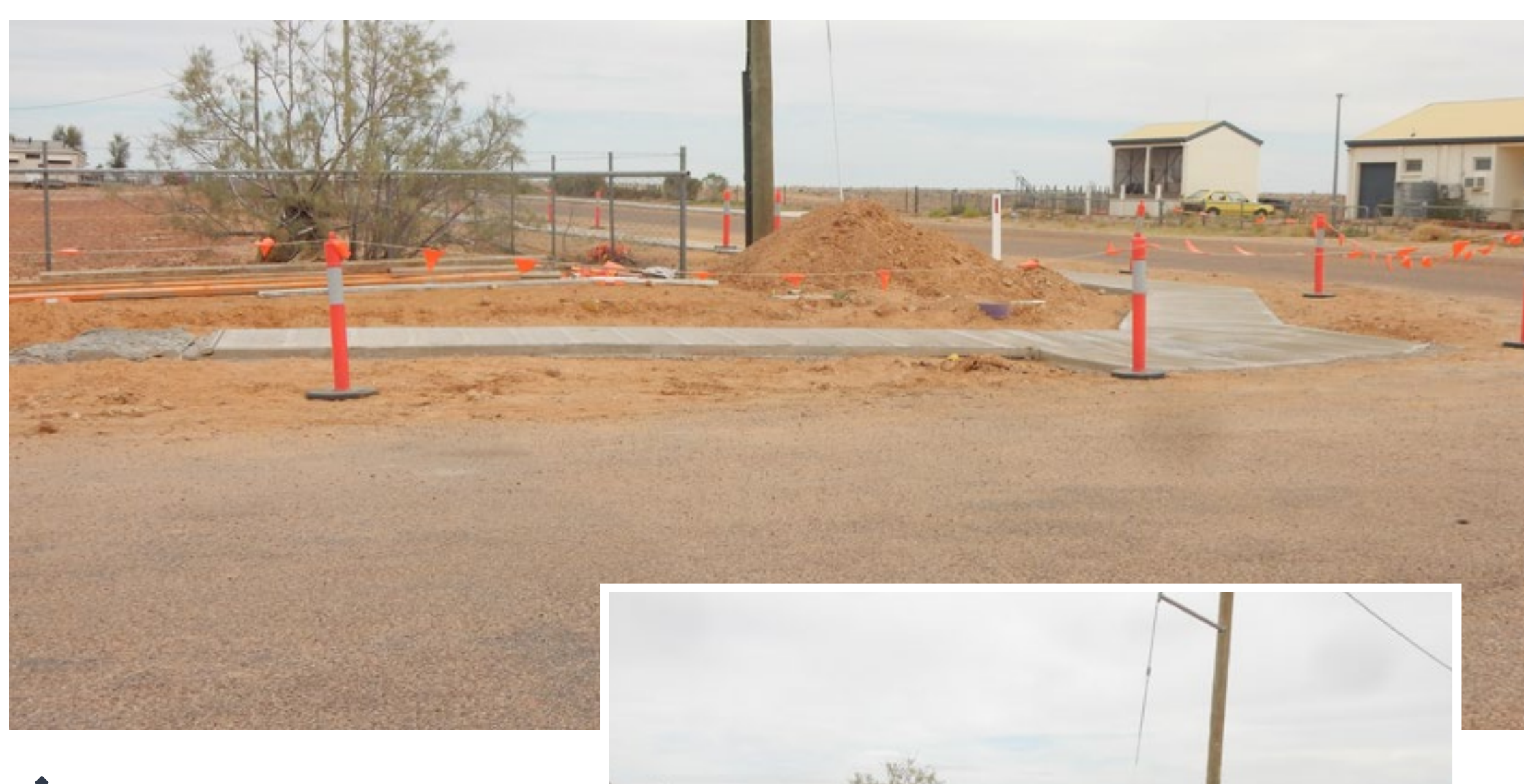
Birdsville footpath, Diamantina Shire Council - installation

The new footpath is more than just a pathway; it significantly improves the town's infrastructure, ensuring that residents and visitors can navigate Birdsville safely, even during peak event times. This project is a testament to the resilience and dedication of the Diamantina Shire Council and its ability to overcome natural challenges to serve its community better.