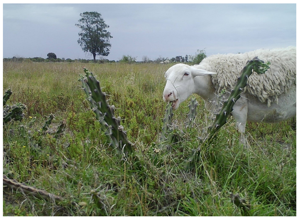
Figure 13 Sheep eating Harrisia cactus