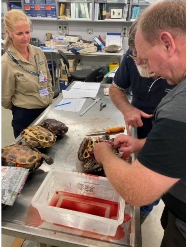
Figure 18 Red-eared slider turtle necropsy