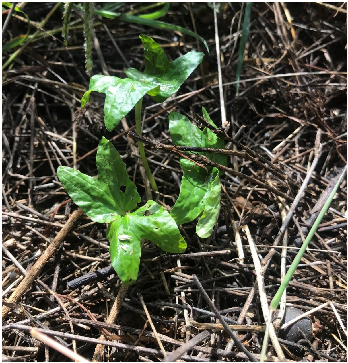
Figure 2 Elephant ear vine (Argyreia nervosa)