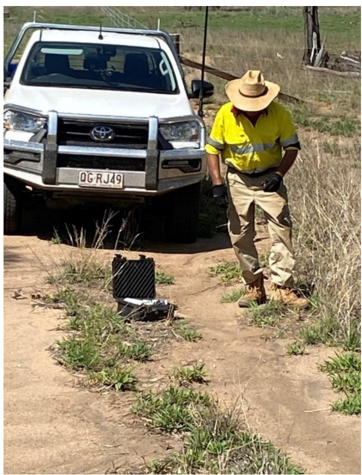
Figure 16 Dog trapping in preparation for satellite telemetry tracking