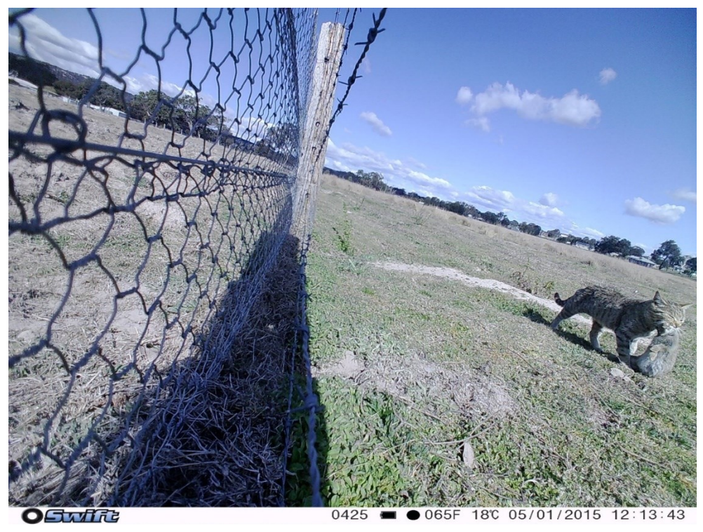
Figure 14 Ground predation of rabbits

Cooke, BD. Brennan, M & Elsworth, P 2018, Ability of wild rabbit, Oryctolagus cuniculus , to lactate successfully in hot environments explains continued spread in Australia's monsoonal north, Wildlife Research , 45: 267-273.