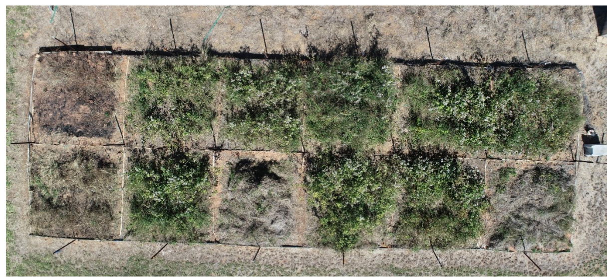
Figure 3 Siam weed (Chromolaena odorata) treatment plot

This project is also investigating the efficacy of low volume foliar herbicides applied to potted specimens via a ground-based boom. Two pot trials allow for considerably greater replication when investigating rates, active ingredients and spray passes than is possible from field observations of aerial boom herbicide applications in the Northern Territory.