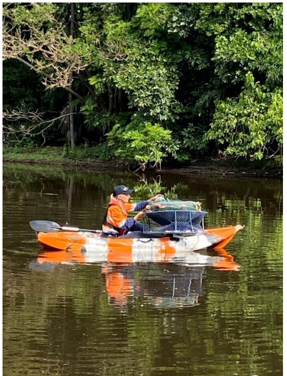
Figure 19 Stacy Harris deploying red-eared slider trap