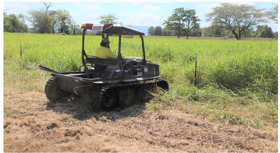
Figure 11 Hinchinbrook Shire Council Argo ATV clearing buffers and marking out plots