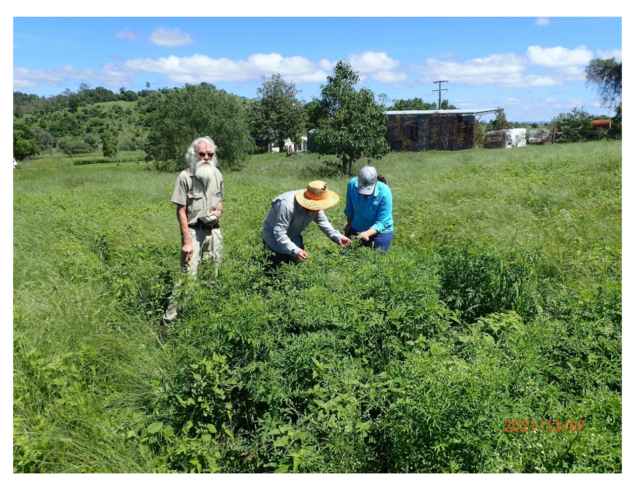
Figure 5 Parthenium biological control survey in Monto

CQ are not present. Hence, the seed-feeding weevil ( Smicronyx lutulentus ), the stem-boring weevil ( Listronotus setosipennis ), the root-boring moth ( Carmenta ithacae ), the summer rust ( Puccinia xanthii var. parthenii-hysterophorae ) and the winter rust ( Puccinia abrupta var. partheniicola ) have been redistributed from CQ into SQ and SEQ. Redistribution of field collected biological control agents from CQ and monitoring their establishment status in SQ and SEQ will continue.