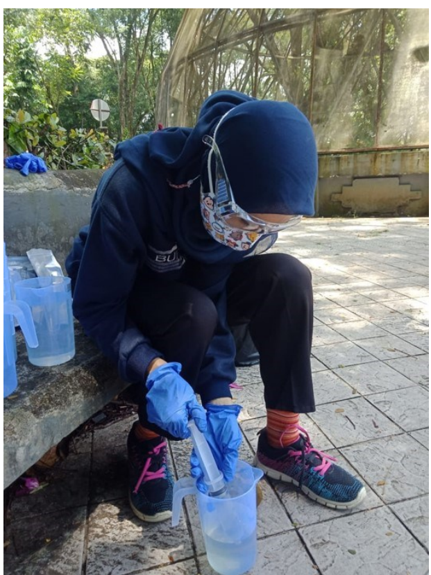
Figure 21 Processing water samples for Asian black-spined toad eDNA in Indonesia