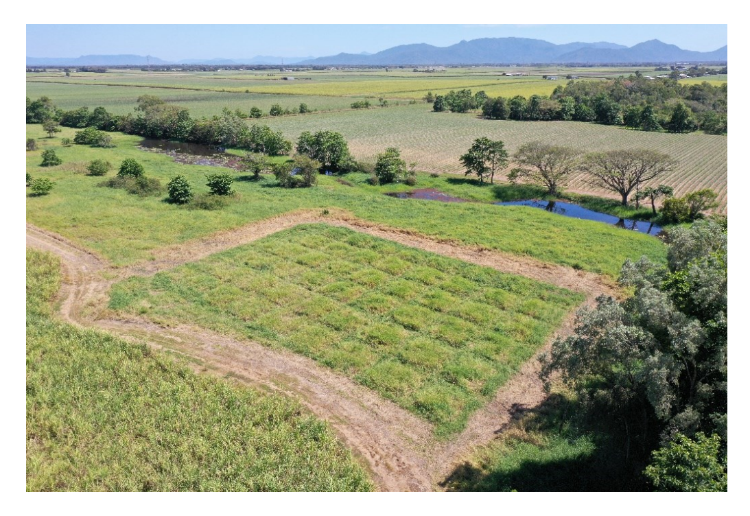
Figure 10 Aleman grass trials