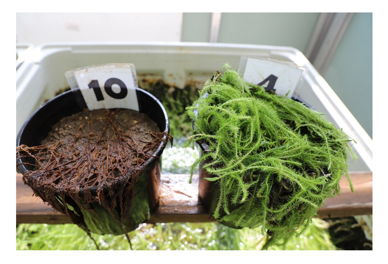
Figure 9 Successful treatment of bogmoss (L) and control (R)