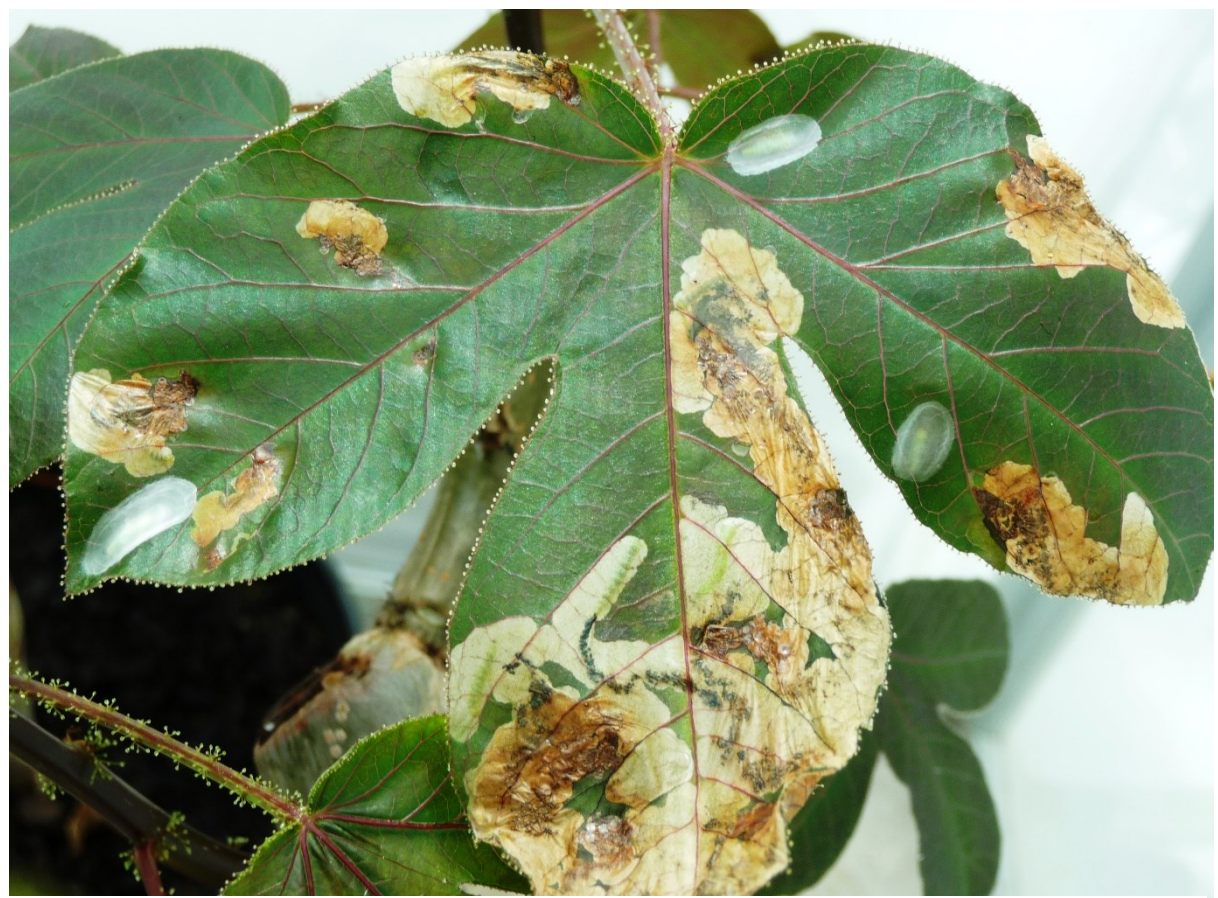
Figure 6 Larval damage to bellyache bush by Stomphastis thraustica