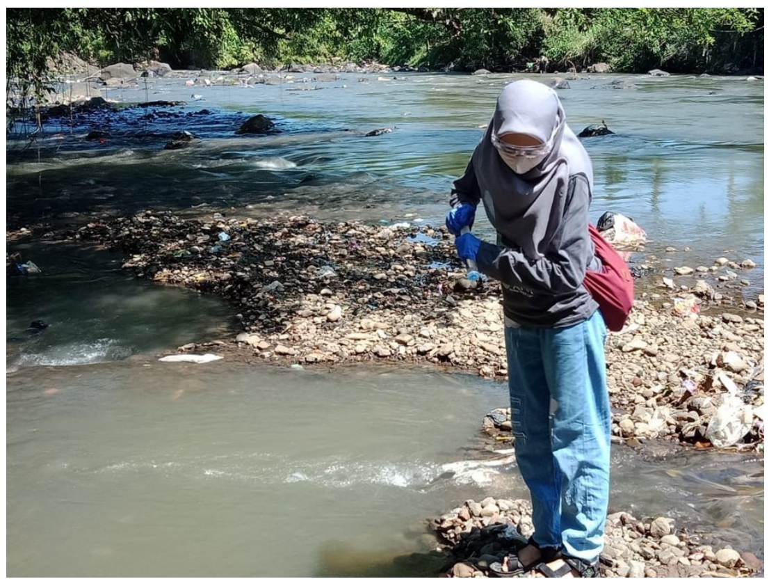
Figure 22 Water sampling for Asian black-spined toad eDNA in Indonesia