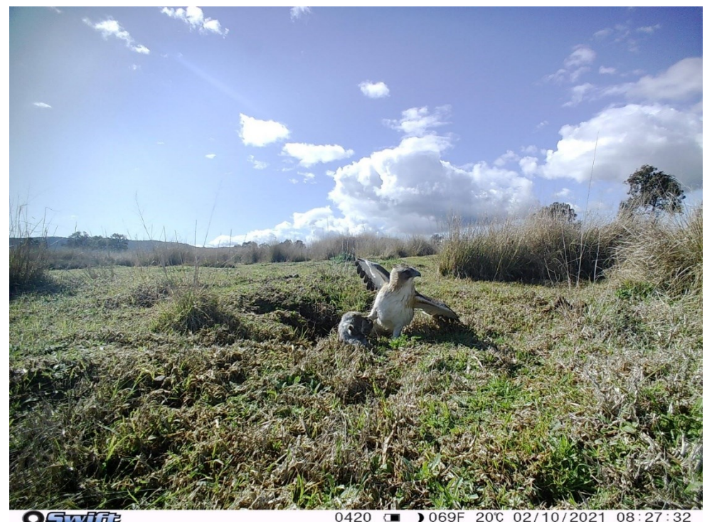
Figure 15 Aerial predation of rabbits