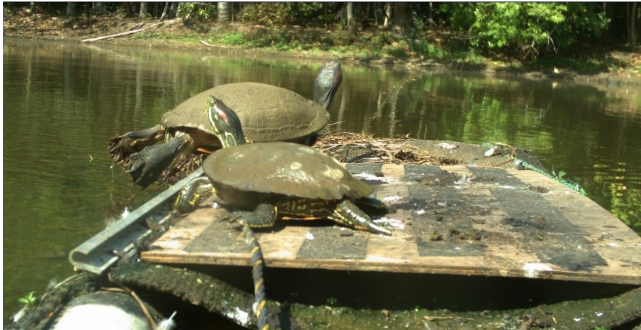
Figure 17 Red-eared slider turtle eDNA collection trap

REST from seven, to one known individual. The remaining individual is a male meaning the known population is functionally eradicated. The project has been able to quantify REST basking behaviour in terms of timing and duration of basking and has assisted collaborators from the University of Canberra (supported by the Centre for Invasive Species Solutions) to develop and test a novel approach to eDNA collection for aquatic basking species. This project will seek to develop surveillance tools for juvenile REST and will continue to increase understanding of REST ecology, effectiveness of eradication efforts, and assist in responding to 'at large' detections of REST.