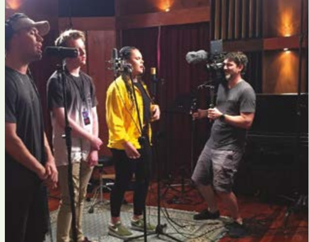
In-studio recording experience.

With long-term generational change needed the Queensland Government developed the Stop the Hurting – End Domestic Violence communication campaign targeting young Queenslanders. Running from June to September 2017, the campaign aimed to raise youth awareness about domestic and family violence and remove the sense of ‘shame’ associated with domestic and family violence.