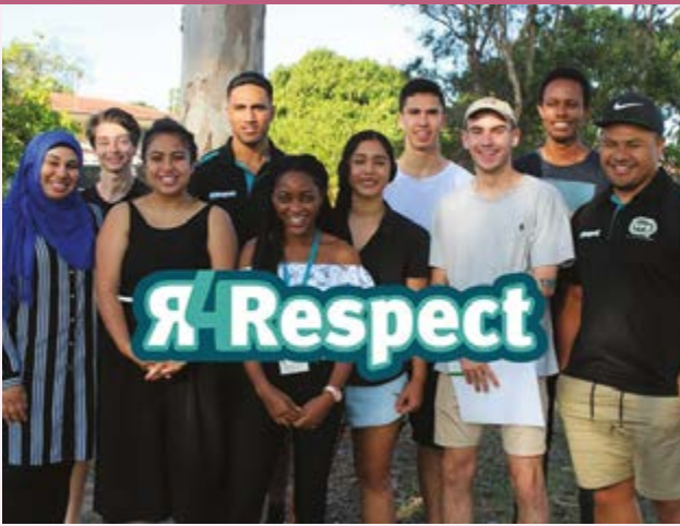
R4Respect Youth Ambassadors, who lead an education and prevention strategy in Logan and surrounds to prevent anti-social behaviour and violence.