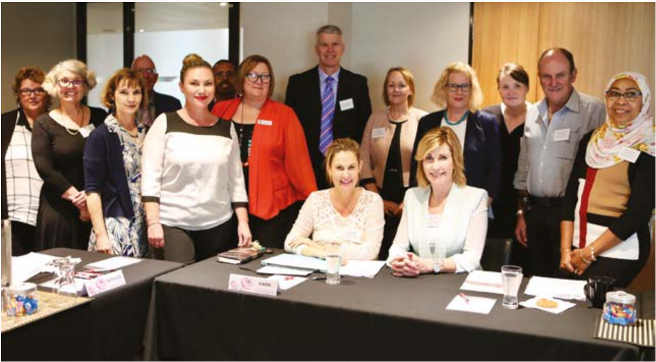
Domestic and Family Violence Implementation Council members during their meeting in Logan.