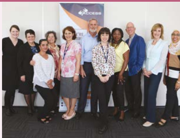
The 99 Steps team with members of the Domestic and Family Violence Implementation Council during the Council's visit to Logan in October 2017.

In addition, the roll-out of domestic and family violence training means that newly employed health service employees are provided with introductory information on domestic and family violence. Health professionals working in Maternity Services, Emergency Department, Child Health, Paediatrics, Allied Health, Mental Health, Alcohol and Other Drugs Service and Aboriginal and Torres Strait Islander and Multicultural Services are required to complete the training within six months of commencement, with a refresher course required to be undertaken every three years.