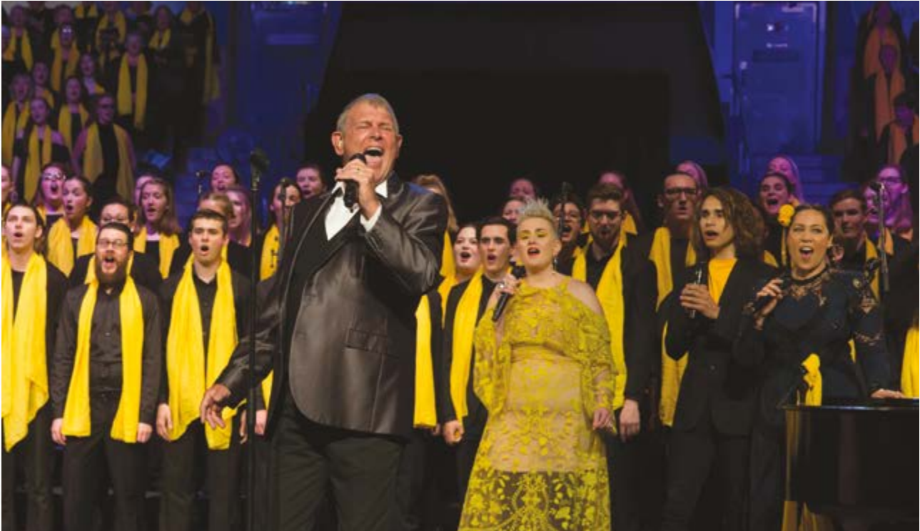
You're the Voice performance at 2017 Queensland Music Festival.