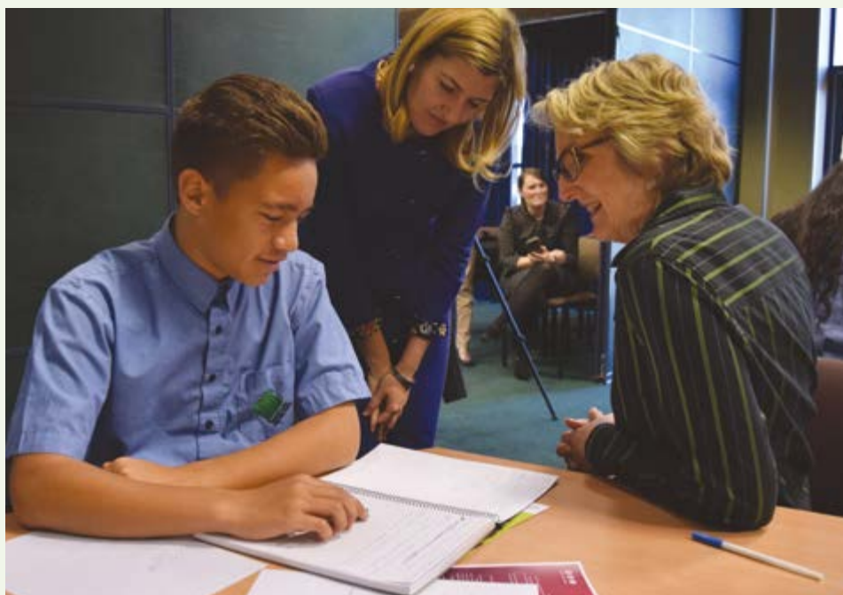
Forest Lake State High School music workshop.

The Council acknowledges the breadth and extent of work being undertaken across the domestic and family violence reform program, and will continue to monitor implementation progress in priority areas through its work groups during 2018.