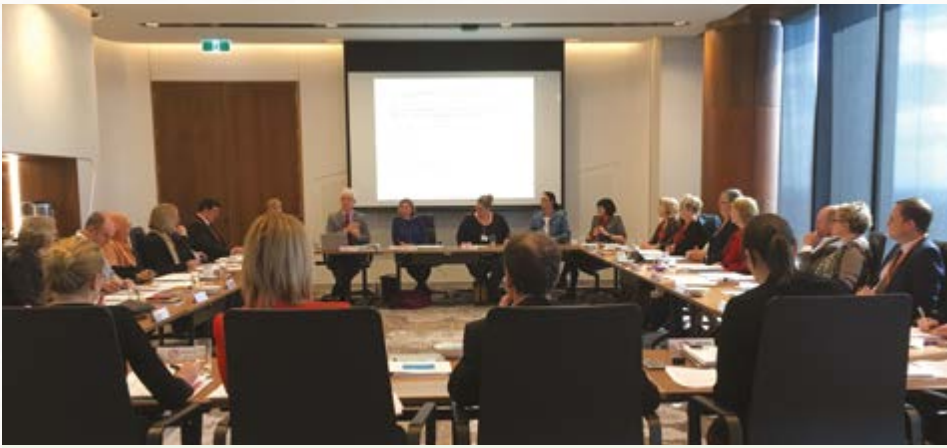
The Domestic and Family Violence Implementation Council during its meeting with stakeholders to discuss domestic and family violence responses for people with disability in July 2017.