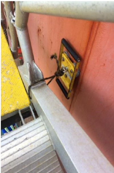
1 magnet for accommodation ladder