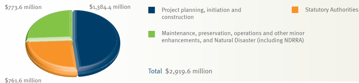
Figure 3: 2016-17 Program allocation – State Network

Figure 3 depicts the 2016-17 program allocation to the State Network.